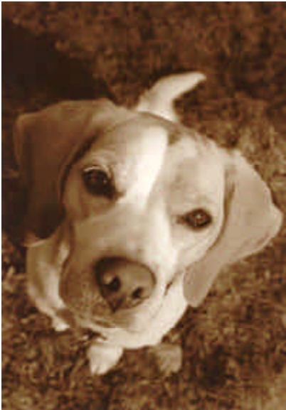
B&W Print: Fauna - Combined "Chessy" Jason Unruh