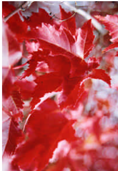
Colour Print: Amateur "Scarlet Entrapment" Laurie McCandless