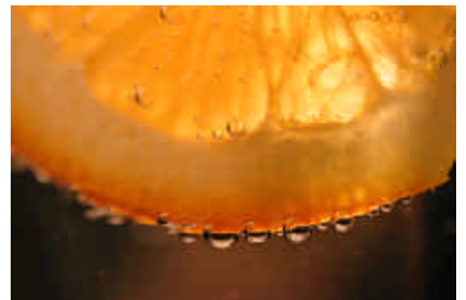
Colour Print: Open - Adv. Amateur "Orange Soda" Glen Tuplin