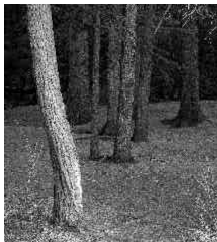
B&W Print: Flora - Combined "Set Apart" Terry Ritz