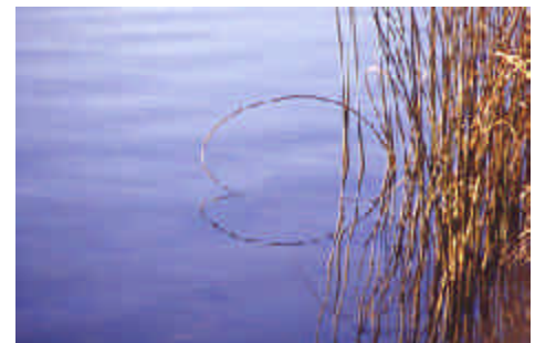
Slide: Scapes - Adv. Amateur "Reed Reflection" Marlyn Toderan