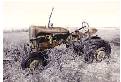
Colour Print: Theme - Amateur "Old Red" Wayne Gilmer