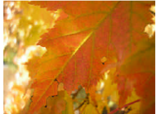
Colour Print: Flora - Adv. Amateur "Fabulous Fall Foliage" Cheryl Behrns