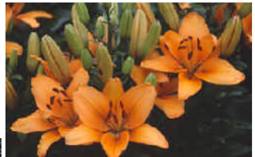
Slide: Flora - Amateur "Lilies" Shirley Gerlock