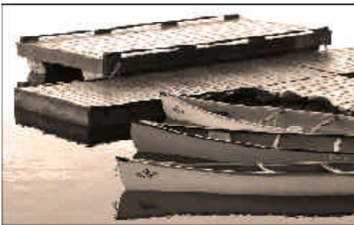
B&W Prints - Combined "Three Canoes" Larry Easton