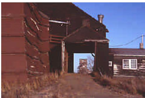
Slide: Open - Adv. Amateur "Looking Back at History" Murray Bryck