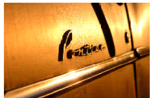
Colour Print: Open - Adv. Amateur "Sunset pontiac" Glen Tuplin