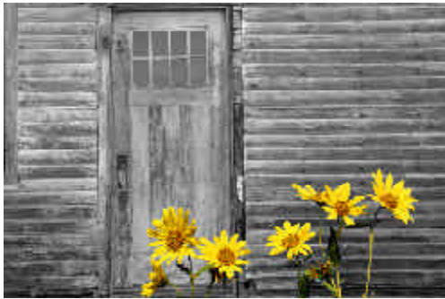
Digitally Manipulated- Combined "Narrow-leaved Sunflower" Larry Easton