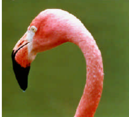
Colour Print: Fauna - Amateur "Long Drink of Water" Claudette Claereboudt